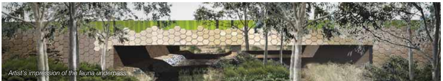
Artist's impression of the fauna underpass.

Some sections of tracks along the freeway alignment are now closed to the public to enable construction to proceed. Please refer to project signage and Parks Victoria Information Boards at Excelsior Drive and Ballarto Road for details.