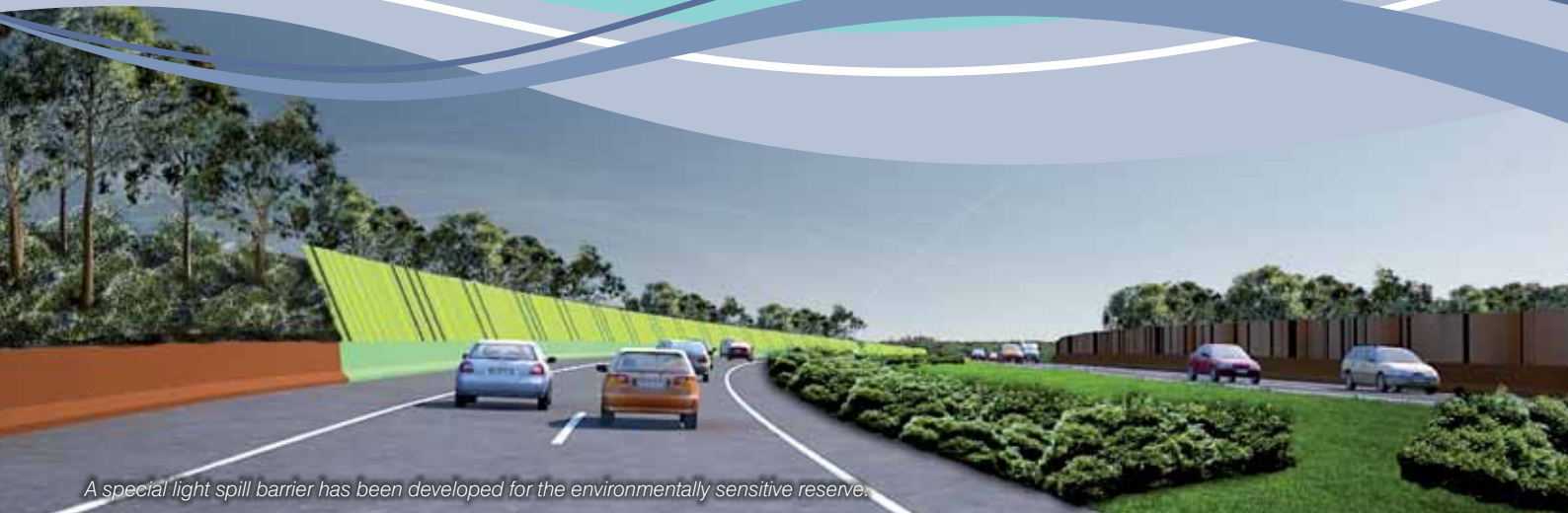
A special light spill barrier has been developed for the environmentally sensitive reserve.