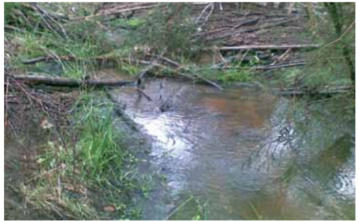
Tamarisk Creek wetland area.

Two 30-metre-wide fauna underpasses and several smaller fauna crossings have been designed and will be constructed to allow animals to continue to move between the areas on either side of the roadway.