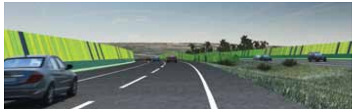
Artist's impression of Peninsula Link.

The Southern Way consortium is financing, designing, building, maintaining and operating the freeway. Southern Way, and its construction contractor Abigroup, are making every effort with environmental management for the project.