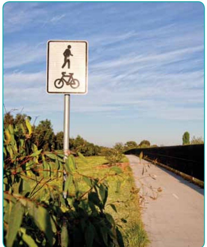
Above: A dashed centre line is to be painted along the length of the path to separate cyclists travelling in opposite directions.

We find that paths such as the Peninsula Link Trail generally attract locals who gain access by foot or bicycle. For this reason, car parks are rarely built adjacent to paths. However, Kingston City Council has noted community concerns and will monitor vehicle parking in the courts and on Old Wells Road.