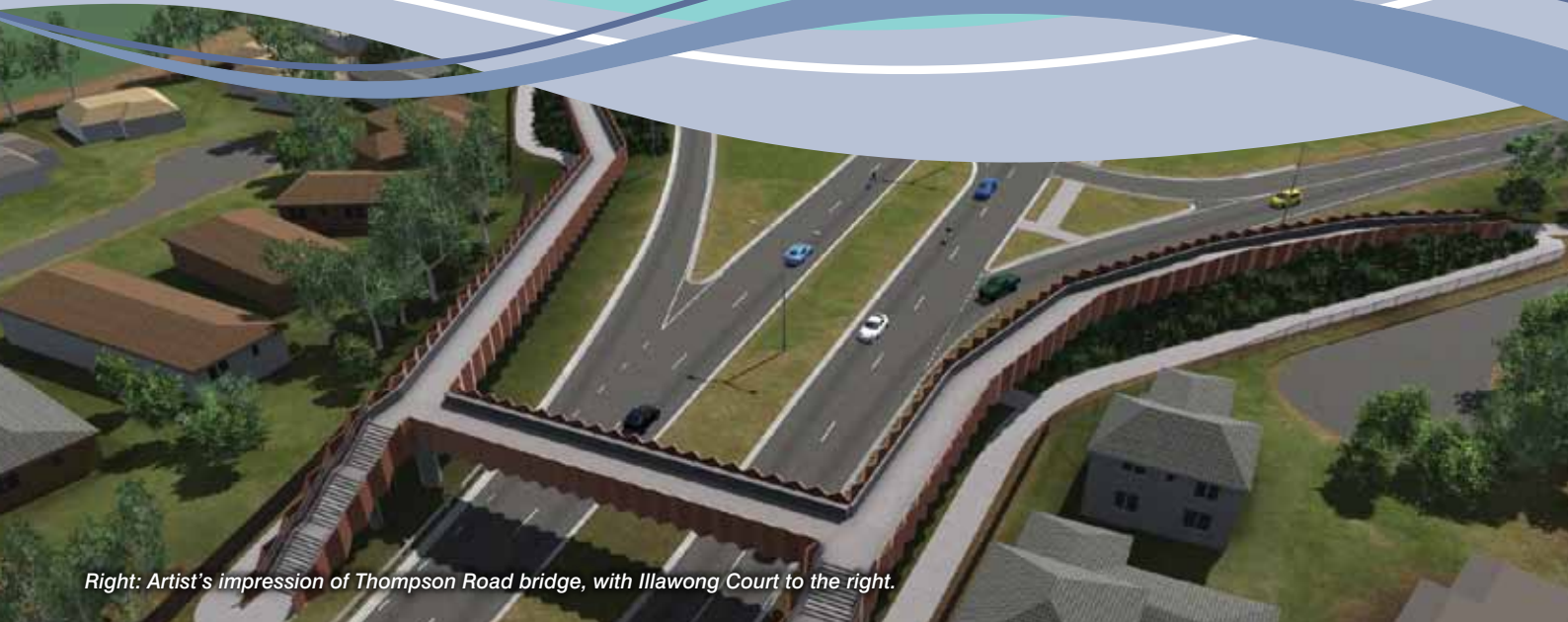
Right: Artist's impression of Thompson Road bridge, with Illawong Court to the right.