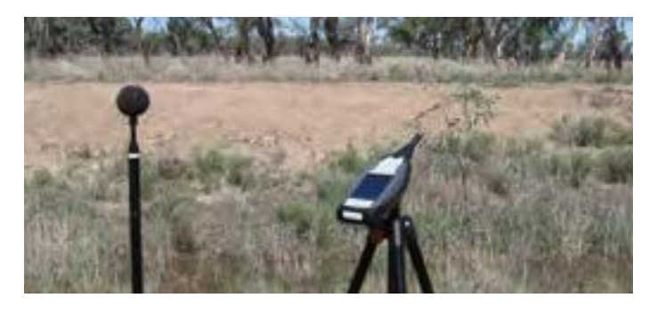
Sound monitoring equipment used for noise modelling.